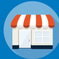
SMALL BUSINESS DIRECT INSTALL