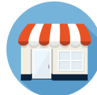
SMALL BUSINESS DIRECT INSTALL